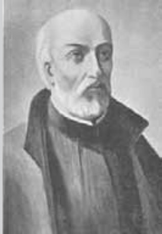
St. John de Brebeuf